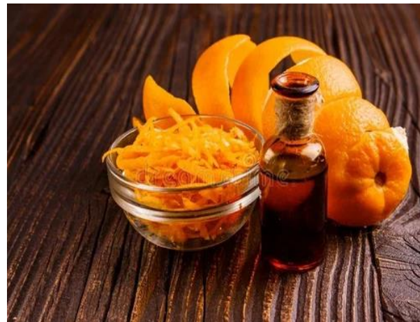
Fig 4 Orange Peel Oil

Therapeutic uses: Essential oil components have insecticidal activities against various insect species and have been found to be advantageous against numerous diseases. Orange peel oil can be used for cleaning supplies, beauty treatments, and aromatherapy. It can be used to strengthen and thicken the outer layer of the skin, smooth out fine lines and wrinkles, and minimize dryness and flakiness of the skin. It also helps boost protein regeneration, as well as collagen and elastin synthesis