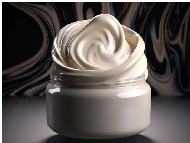
Fig 2 Cold cream.

The emulsifying agent used in the cold cream type is really a soap formed in-situ by the interaction of borax with the free acid of the beeswax. Borax or sodium tetra borate is usually marketed as a decahydrate. Borax is hydrolyzed by water and the solution has marked alkaline reaction. It is a cosmetic that calms and cleanses the skin; it often has an oily and heavy consistency 10 . It fits the description of a cleansing cream.