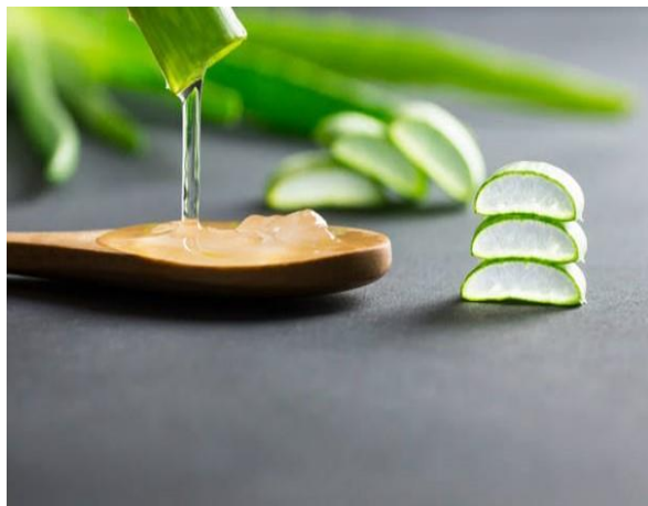
Fig 3 Aloe vera gel